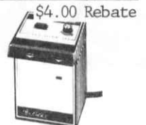
SHAVERS CHOICE™ HOT LATHER DISPENSER SCD-3/5703-005

CHOICE OF: TEMPERATURE SHAVE CREAM OR GEL AFTER SHAVE LOTION