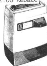
HEATED SHAVE CREAM DISPENSER SCD-1

uses over 30 leading brands! $2.00 Rebate