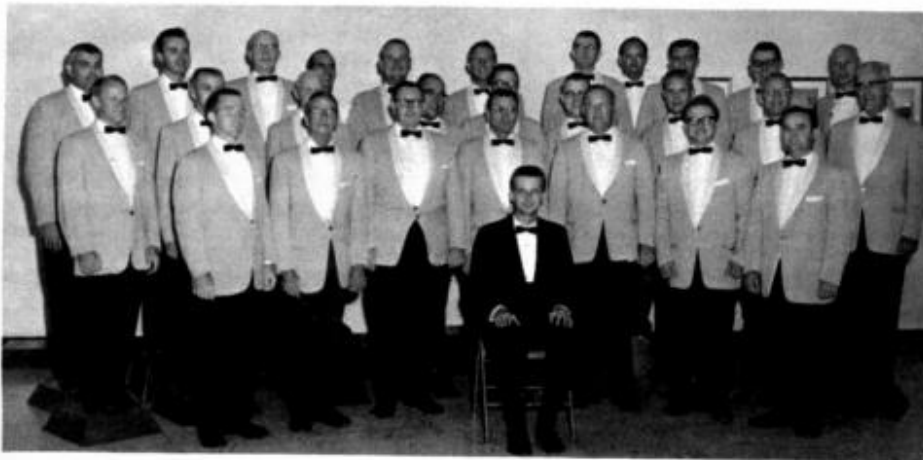
The "Chorus of the Blue Ridge" of the local chapter of S.P.E.B.S.Q.S.A.

For Sale: Fireplace & heater wood. Oak & hickory. Call 846-7588. ...Girl's bicycle, blue, 26", coaster brake. Good cond. $10. Call 384-2071. ...Two snow tires. 7.75-14. Call 384-3061 after 6:00 p.m. ...'67 Ford Fairlane XL hardtop. 6000 miles. Call 239-1596 or see at 1510 Eastlake Dr. ...'61 Ford Starliner, straight drive, V8, black roll-pleat interior. $600 or best offer. Call 239-2786 after 5:00 p.m. Wanted: Experienced lady would like to keep children in her home while parents work 5 or 6 days a week. Call 846-3953. ...Need 50 silver dollars immediately. Will pay $1.30 to $1.40 each. Call 239-1321 after 5:00 p.m. ...Ride from Atlanta Ave. Southland Acres to Mt. View Road 7:30 a.m. to 4:00 p.m. Call 239-4339 after 5:00 p.m. ...Children to keep in my home while parents work. Timberlake area. Two meals daily, ref. furnished. Call 239-6629.